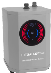
Ideal Hot Water Tank™ (Required)